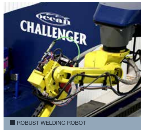
■ ROBUST WELDING ROBOT