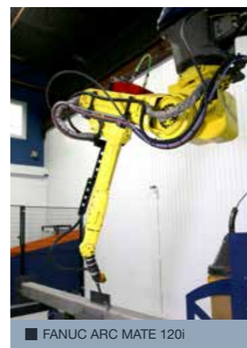
■ FANUC ARC MATE 120i