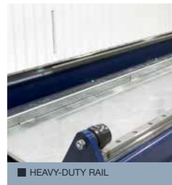
■ HEAVY-DUTY RAIL

The Ocean Challenger welding robot is designed specifically for structural steel fabricators looking to increase production and reduce labor costs. The compact footprint, robotic automation and easy to use software makes the Ocean Challenger the ideal solution for any size shop striving to be more efficient and cost effective.