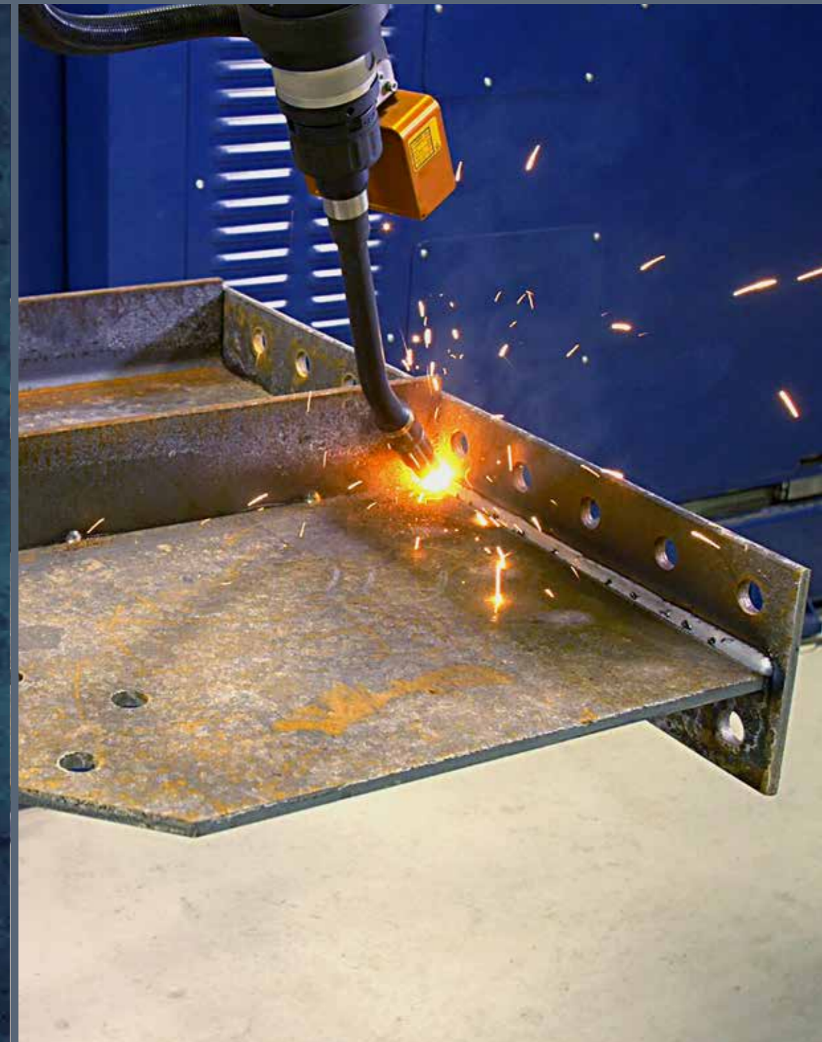
Challenger Robotic Welder Specs