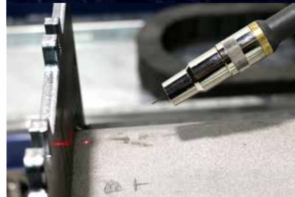
■ LASER TOUCH SENSING OF PART TO BE WELDED

Laser curtains ensure a safe working environment for the operator.