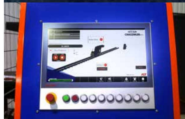
■ EASY-TO-USE GRAPHIC INTERFACE

Once the robot has completed the part it returns to the home position, and the operator is then able to turn the beam to the next face to be welded, or remove the completed part and load the next part to be welded.