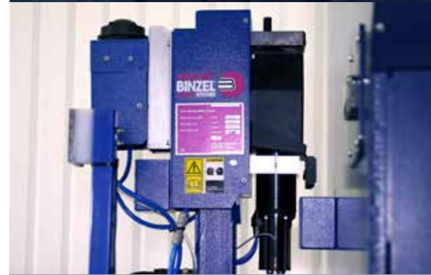
■ TORCH CLEANING STATION