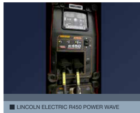
■ LINCOLN ELECTRIC R450 POWER WAVE

Typically, a structural steel fabricator spends a substantial amount of time on labor intensive, repetitive operations such as fitting and welding. Imagine how much simpler things would be if any part of this process could be affordably automated.