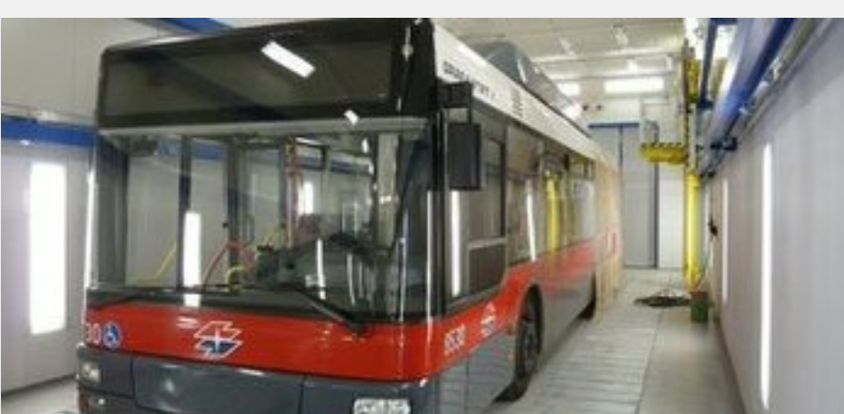
Utility vehicle construction